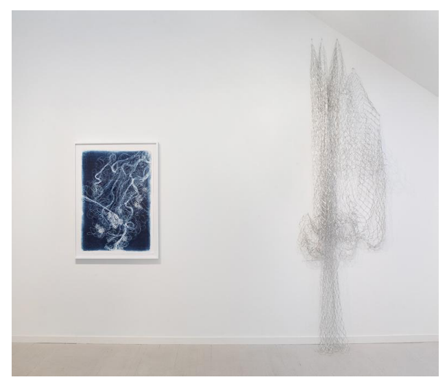
Above: Installation with Monoprint 1 , 2023 and Net , 2023 Left: Ghost Net, 2022, unique screenprint on paper, 60 x 44 in.

Hope's interest in seine netting as a sculptural medium was prompted by a 2019 visit to Maputo, Mozambique for an Art in Embassies commission. Mesmerized by heaps of discarded fishing nets strewn on the beach across from the U.S. Embassy and inspired by their resonance, she soon embarked on planning Murmuration 1 , an undulating wall sculpture comprising monofilament netting and masses of Modello can tabs. In 2022, a related large-scale work was exhibited at The Church in Sag Harbor. Last summer netting took on a buoyant and more visible role in an outdoor project sponsored by Guild Hall Museum at the site of the historic Amagansett Life-Saving Station. Ghost Net (2022), the five-foot tall silkscreen at The Drawing Room serves as a poignant two-dimensional evocation of that ephemeral installation.