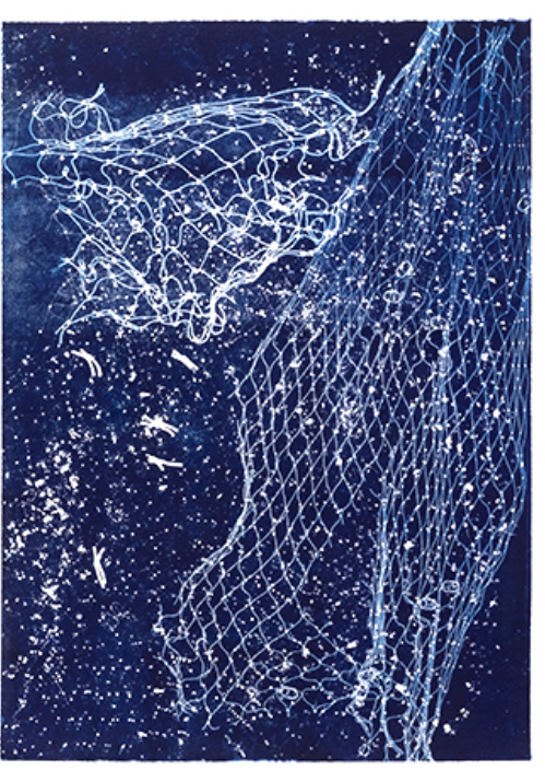
From Give and Take, 2023, ink on paper, 42 x 29 1/2 inches

Named New York's "Woman to Watch" in 2018 by the National Museum of Women in the Arts, Hope is widely recognized for the public and privately commissioned installations that are central to her practice. This exhibition introduces the artist's monoprints, which capture on paper the compelling three-dimensional presence and tactility of her monumental work. Accompanying the works on paper is an ethereal sculpture that cascades from the wall, a flexible grid of reflected light and delicate shadows.