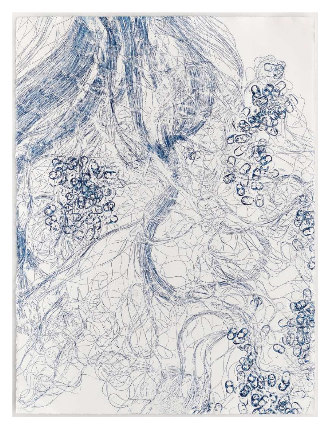
Monoprint 4, 2022, ink on paper, 30 x 22 inches