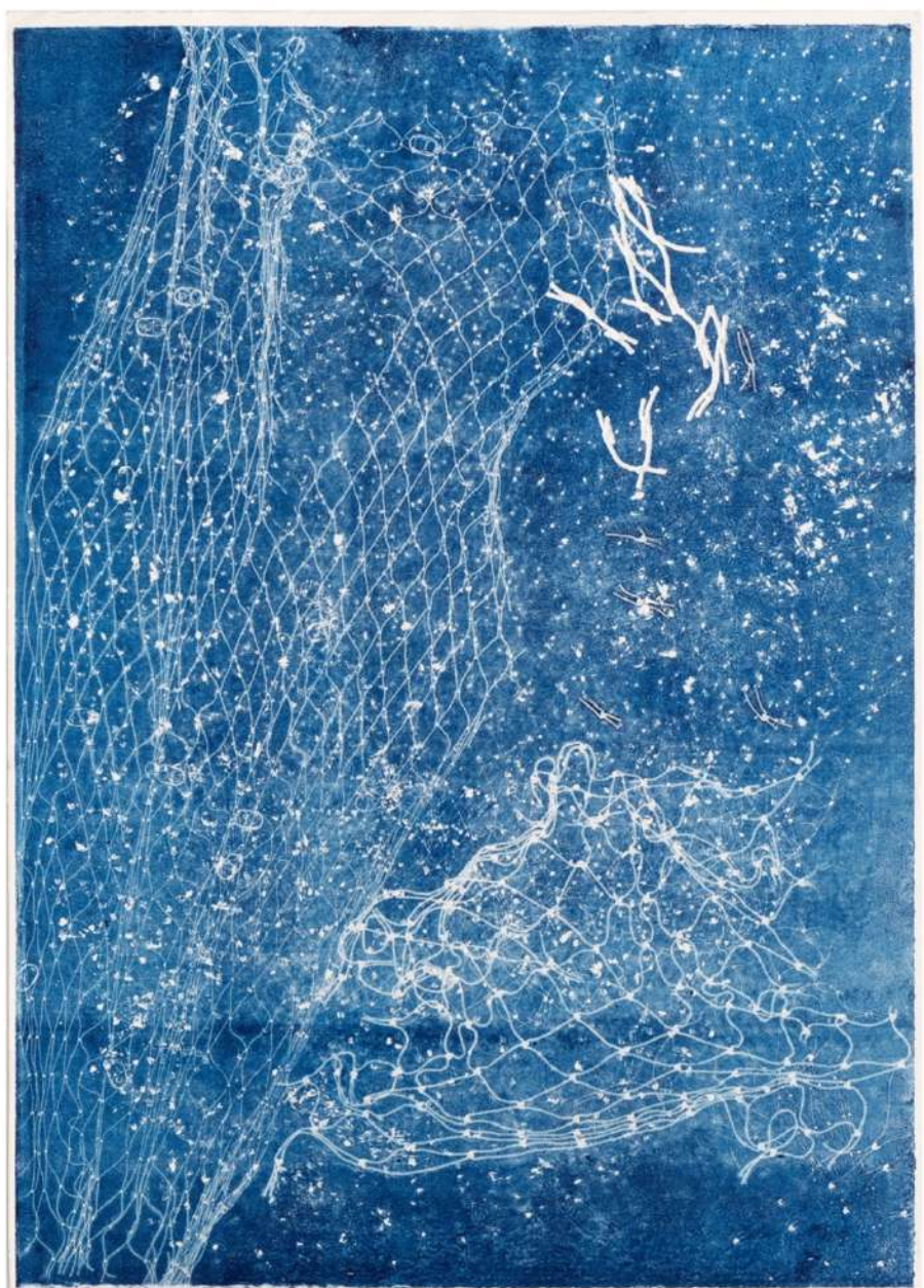
From Both Sides Now, 2023, ink on paper, 42 x 29 1/2 inches (each)