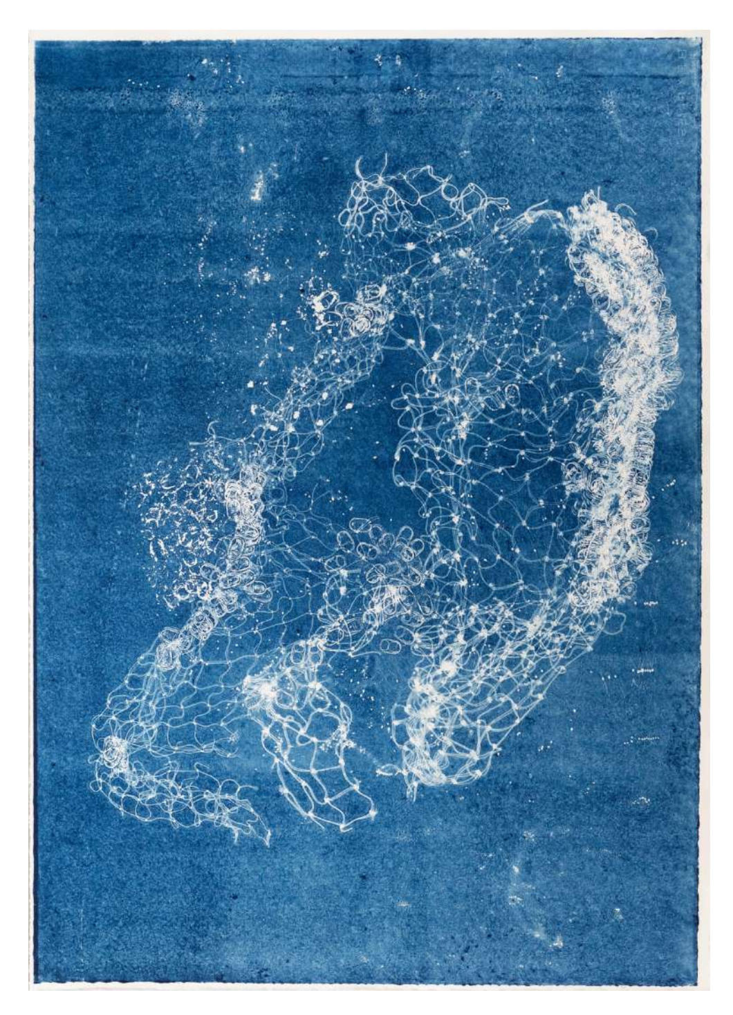
Monoprint 6, 2022, ink on paper, 42 x 29 1/2 inches