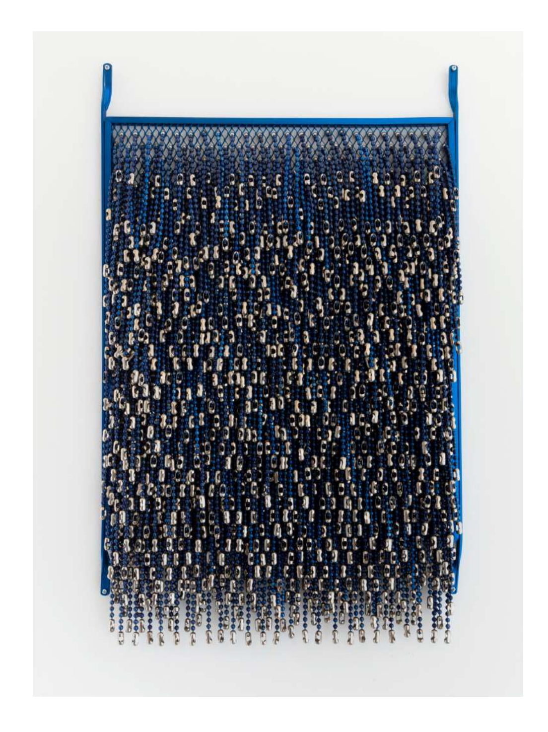
Untitled, 2017, aluminum screen door grille (anodized), steel powder coated ball chain, steel connectors 30 x 20 inches