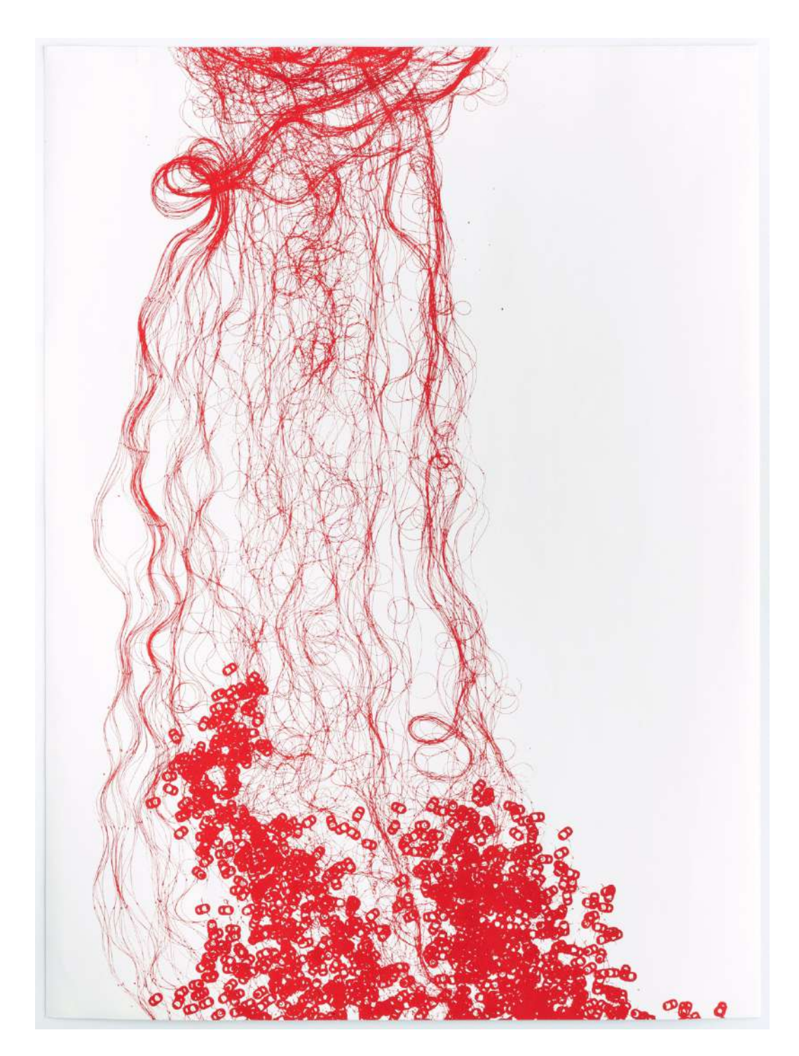
Ghost Net, 2022, ink on paper, 60 x 44 inches