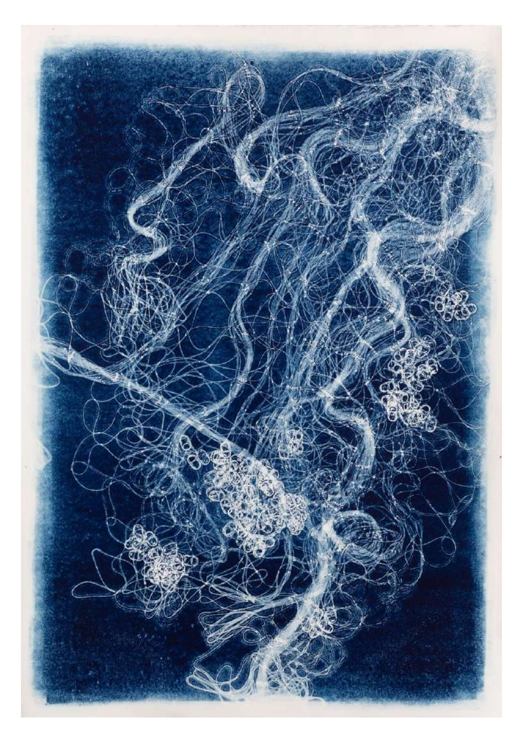
Monoprint 1, 2022, ink on paper, 42 x 29 1/2 inches