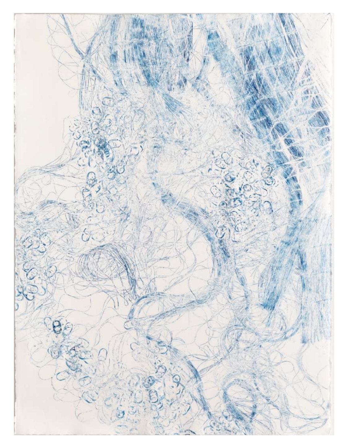
Monoprint 5, 2022, ink on paper, 30 x 22 inches