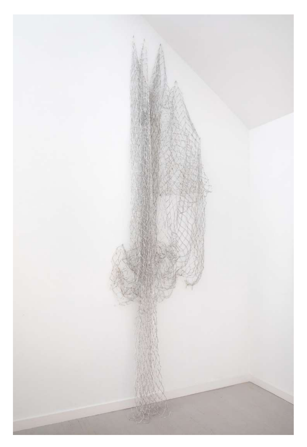
Net, 2023, seine net, aluminum tape, resin, dimensions variable