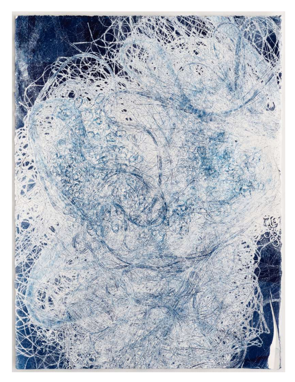
Monoprint 2, 2022, ink on paper, 30 x 22 inches